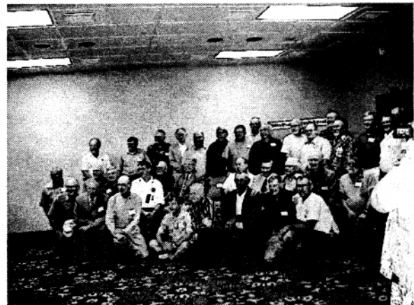
Older, grayer, and maybe a little heavier; but if their country called, these men would gladly do it again!