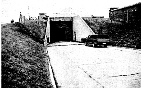
The entrance to site 9, now a school.